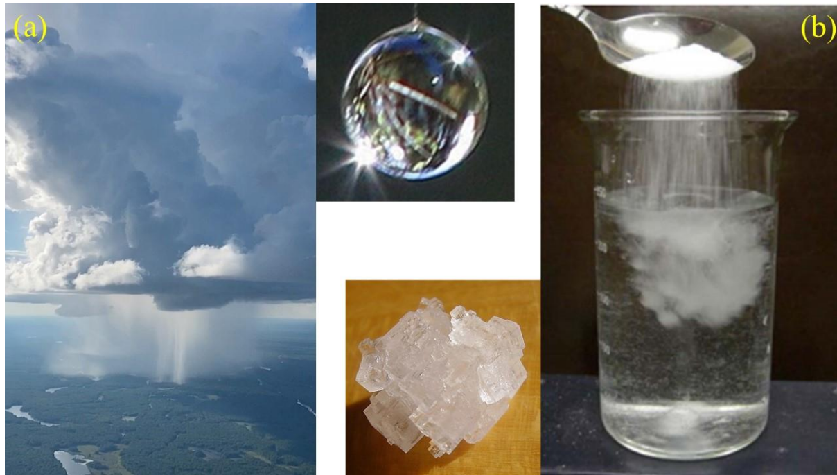
Figure 1 Analogue relationship